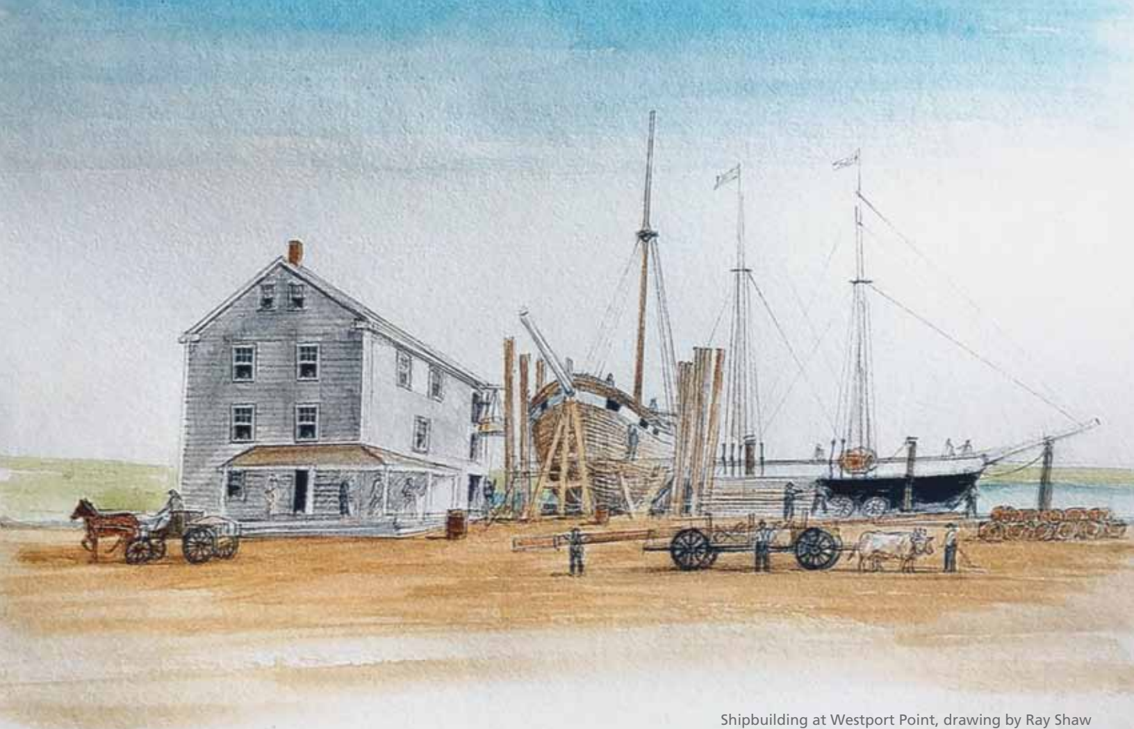
Shipbuilding at Westport Point, drawing by Ray Shaw