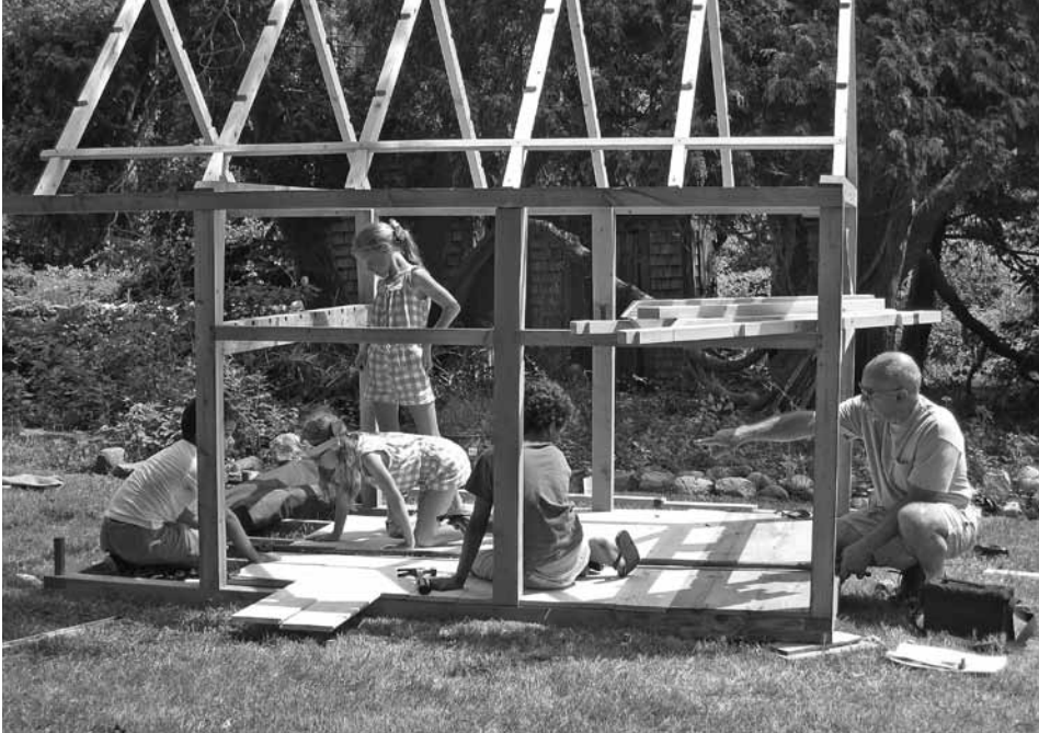
With your support, kids explore basic construction techniques and learn how to use tools as part of our Discovery House project.