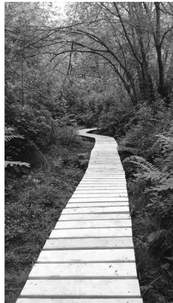
With your support over 400 families explored some of the most beautiful and historically significant places in Westport as part of our Summer Passport activity.

This year, for the first time, we were able to offer a year-round schedule of public programs, including evening lectures in the summer months, and our new winter history forum, a series that encourages individuals to present research and to take on new research projects. We are pleased to report that the WHS suffers from problem, rare for historical societies, of overwhelming attendance to many of our programs. Topics varied widely from slavery to pre-hurricane East Beach. Many of our programs can be viewed on our website. Now in its third year, Westport History 101, presented by Tony Connors, provided an in depth introduction of the story of Westport from the ice age to the Second World War.